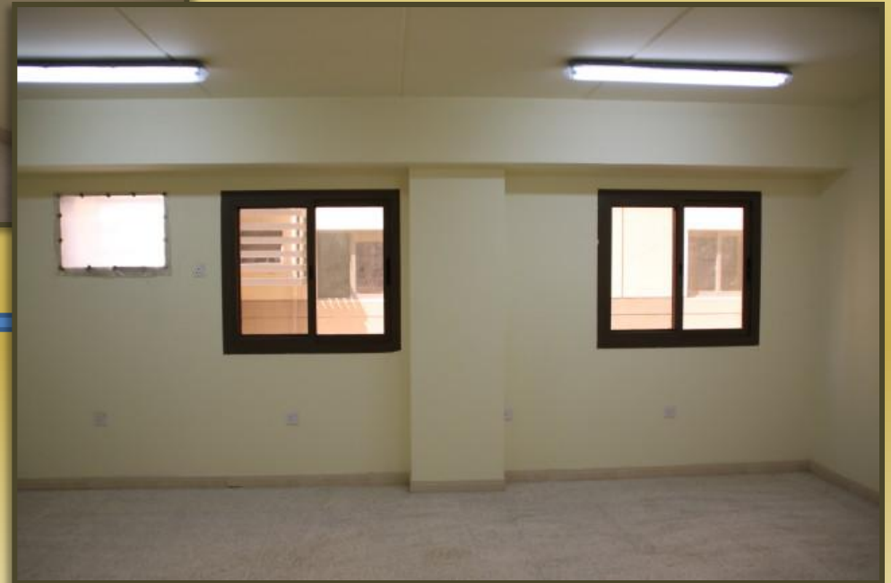
Double Room Size 18' x 27' ←