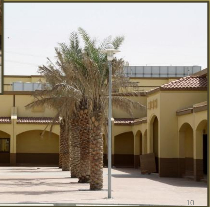
← Proposed Restaurant Area