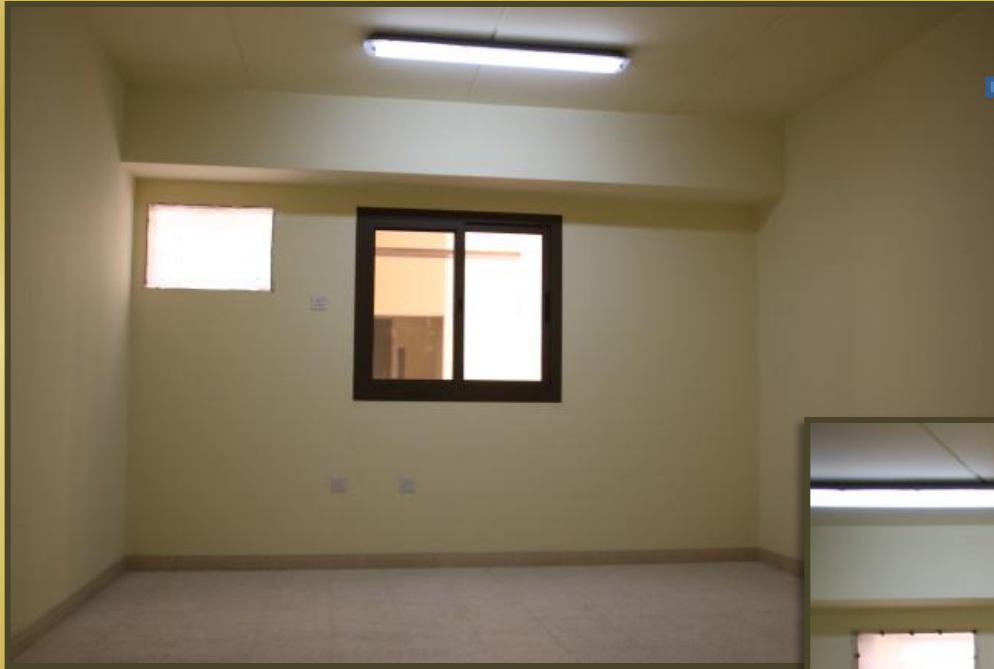
→ Standard Room size – 13'x18'