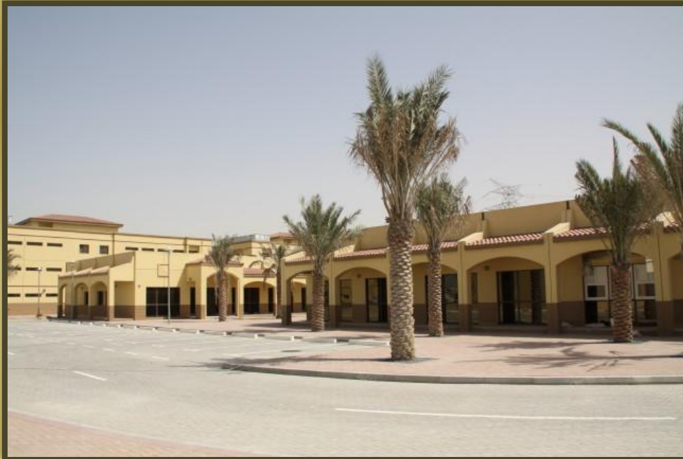
→ Proposed Super Market Area