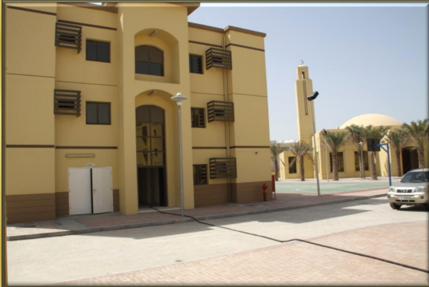
Independent Block Dedicated for Ladies' Accommodation